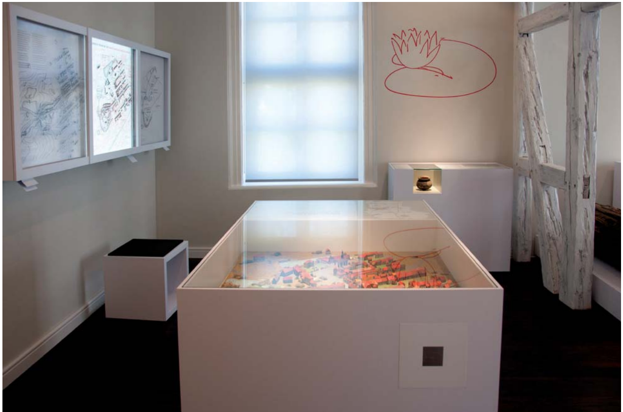
City model with integrated features for children