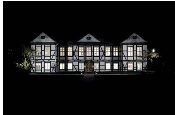
Baroque hunting lodge. entrance

The exhibition has a modern pedagogical approach and offers attractions and information for all age groups. Additionally, value was placed to increase children participation through experimental- and multimedia stations. In this way the museum can be accessed by a variety of senses, understanding through seeing, hearing and touching.