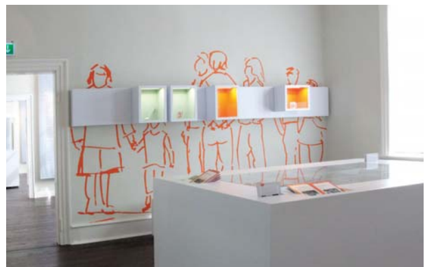
vitrine system with objects and datapool