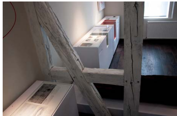
Exhibition vitrines with printed text