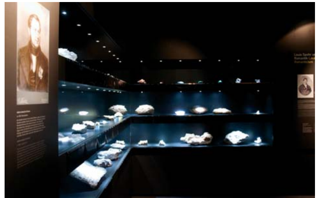
Vitrines for minerals with integrated lighting