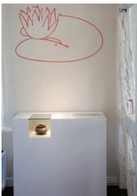
Vitrines with coloured recesses for objects and wall graphic