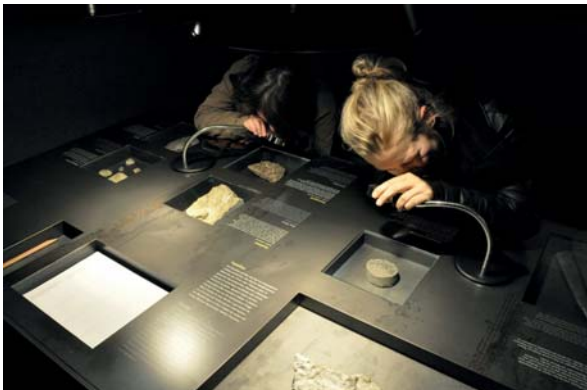
Exposed minerals for children for exploration