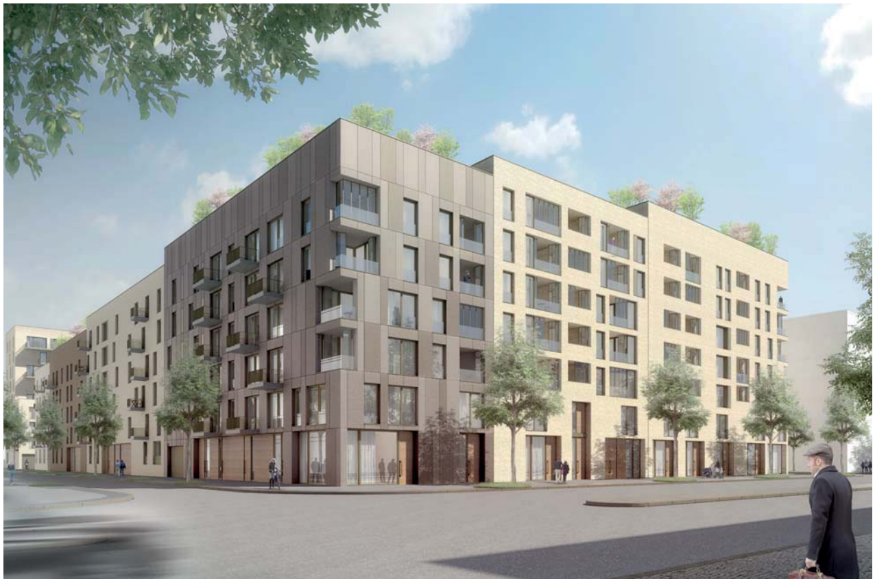
residential block: view from Heidestraße