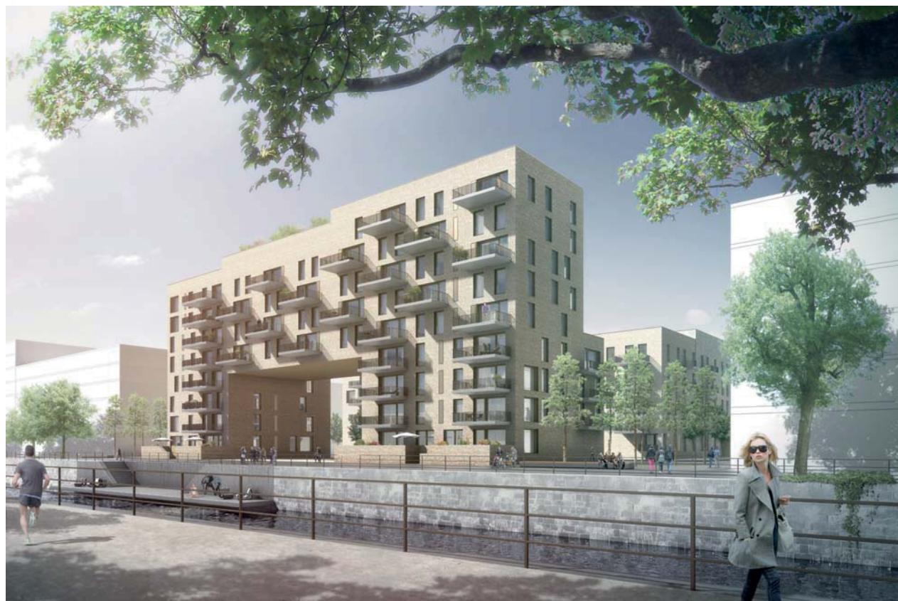
Wolkenbügel and the square at the waterfront