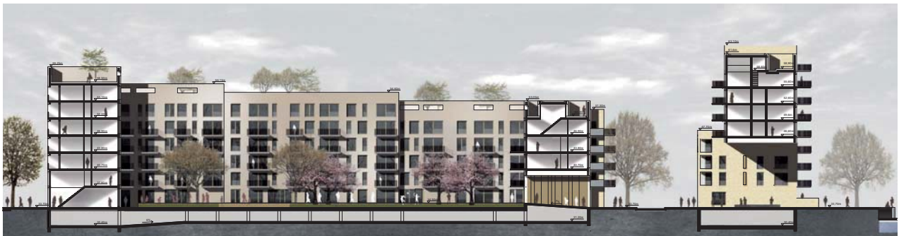
section and elevation of block and Wolkenbügel