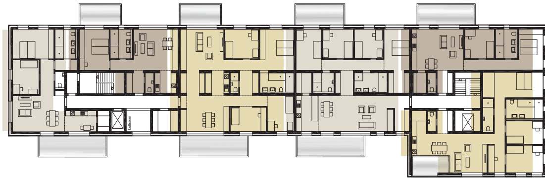
floor plan "Wolkenbügel"