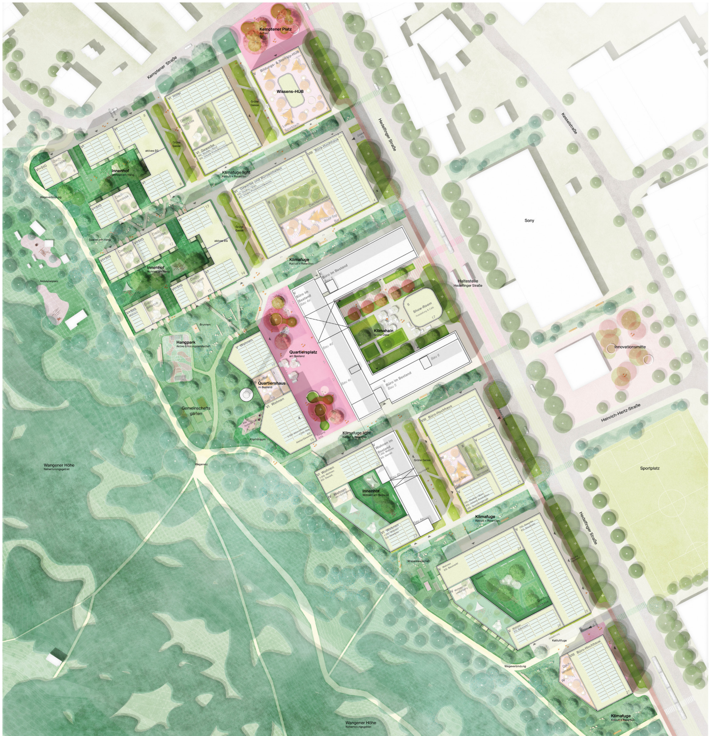
Site Plan of the complete development