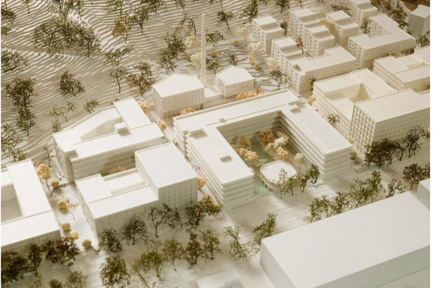
Physical model of the neighborhood center with renovated existing buildings