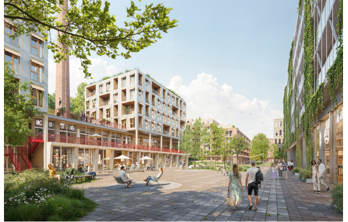
Center of the neighborhood with an addition to the existing building