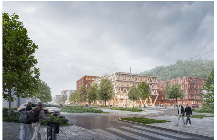
Northern entrance to the neighborhood with a building block featuring a library

As the gateway to the Wangen district on Hedelfinger Straße, the SCHAFFEREI serves as a structural, spatial, and programmatic link between the neighborhoods of Wangen and Hedelfingen, the cultural landscape of the Wangener Höhe, and the Neckar River. With its urban density, it becomes a new focal point for the local community and the city as a whole. The urban form accentuates the street space with low-rise peaks and opens up in an east-west direction via generous, biodiverse "climate joints" toward the sensitive landscape areas of the Neckar and the Wangener Höhe. The climatologically driven east-west division splits the building mass into six well-ventilated, flexible building strips that orient themselves toward a vibrant center around the identity-defining existing Kodak buildings. In this way, existing and new buildings are combined into a diverse, productive neighborhood featuring various typologies. The public open space consists of green "climate corridors," a network of small paths and alleys, small plazas, the "neighborhood plaza," and the versatile "Hangpark." The concept promotes flexible, multifunctional spaces, ensuring adaptability to future needs.