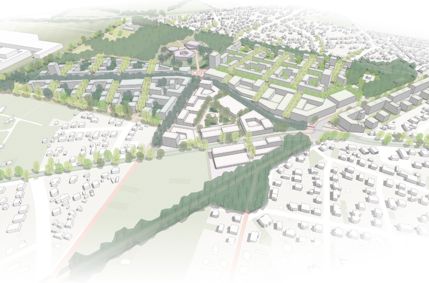
The flyover highlights the intersection of city and countryside.