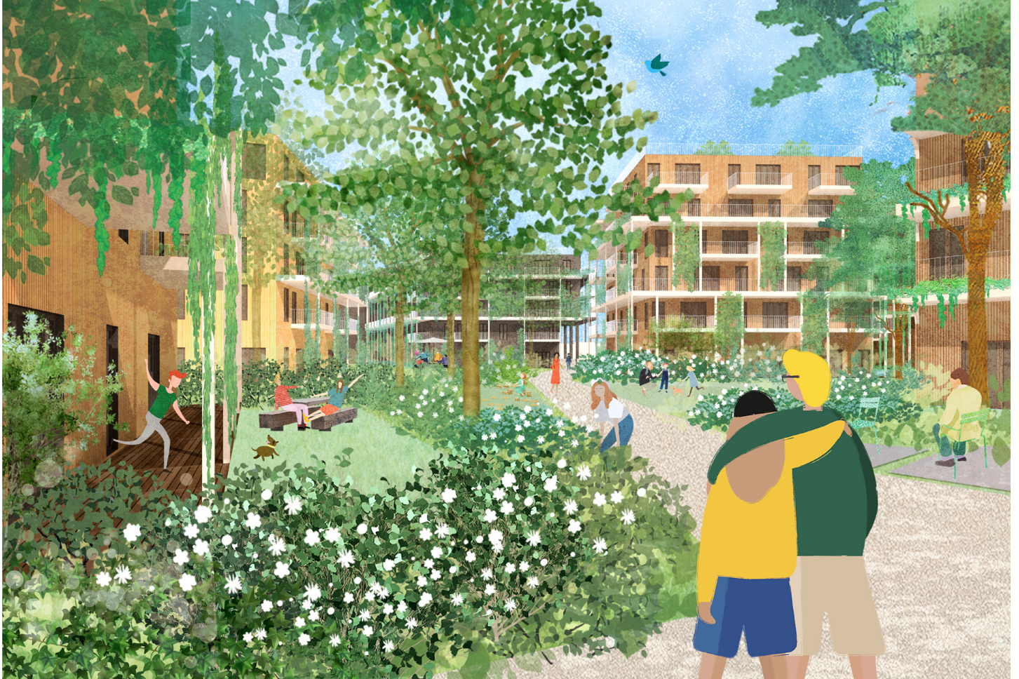
Perspective view of the central green area looking north