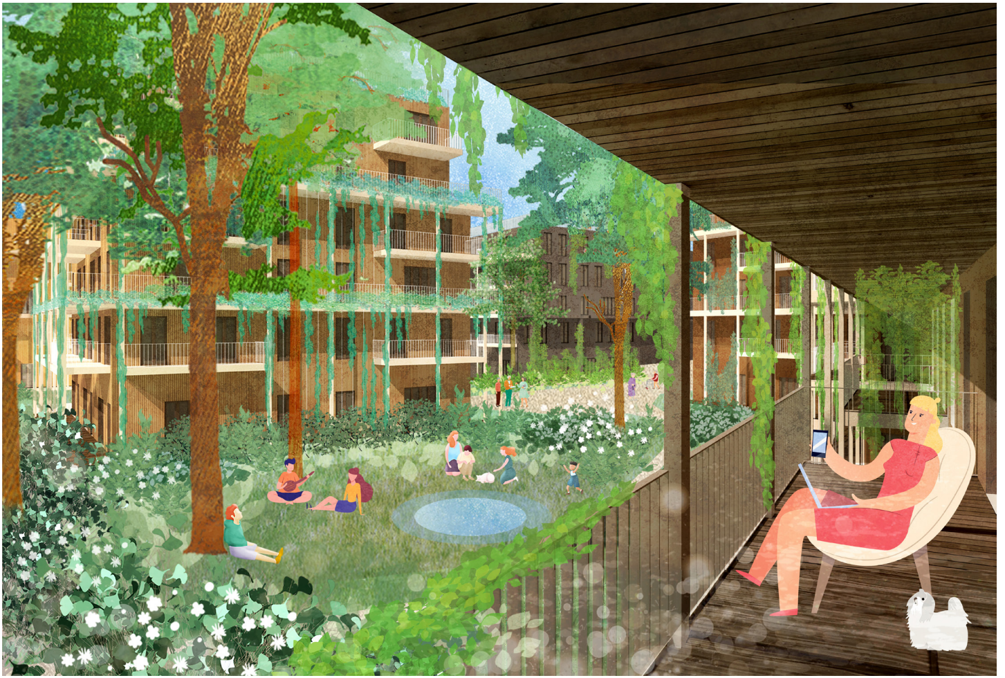
Perspective view looking into one of the chambers