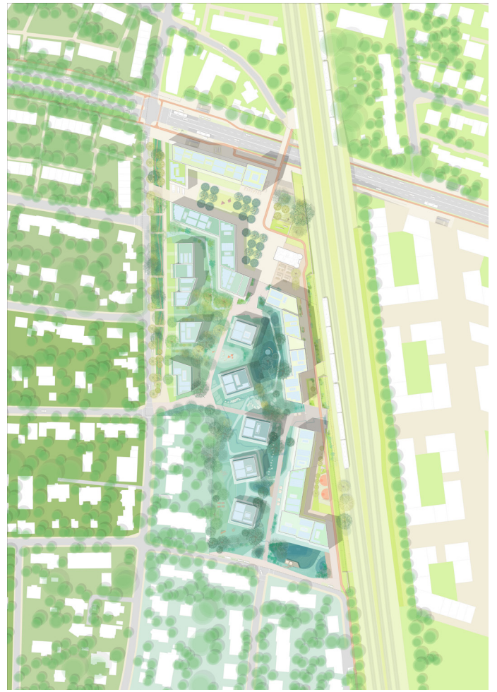
Masterplan, Variant A

To achieve this, our design is structured into overlapping levels of order, creating differentiated and precise spatial relationships: The construction structure is divided into four typologies. In the west along Marienburger Straße, the existing structure of rowed, rhythmically offset, small-scale buildings is appropriately complemented to ensure spatial permeability. This is followed by a loose sequence running north-south of individual building volumes (urban villas) increasing in mass and height, set in a landscape park-like arrangement. A third row consists of elongated structures on the east and north sides, which are more monolithic and taller in the northern part, gradually transitioning to a sequence of architectural individual units towards the south.