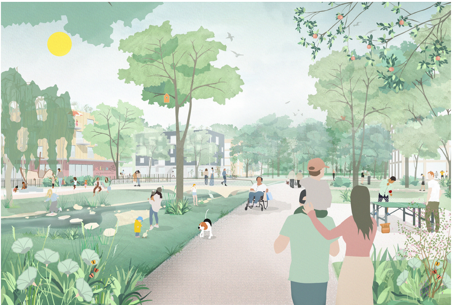
View of the Generations Park as the green centre of the Waldstadt