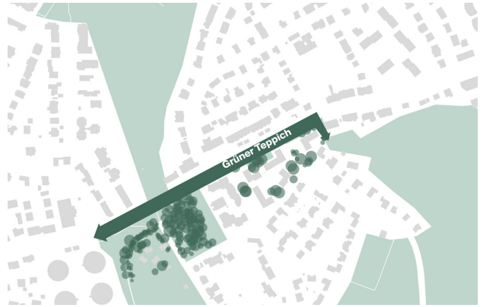
The green carpes as an invting Entrée

Brandenbusch-Platz, as a publicly effective square and protected new centre, links the new neighbourhood with the existing listed estate and promotes interaction. A new connection is created at the usage level: the social and cultural facilities in the neighbourhood are placed in a new context by the design. The connection between the church and the school is created by the Brandenbusch corner.