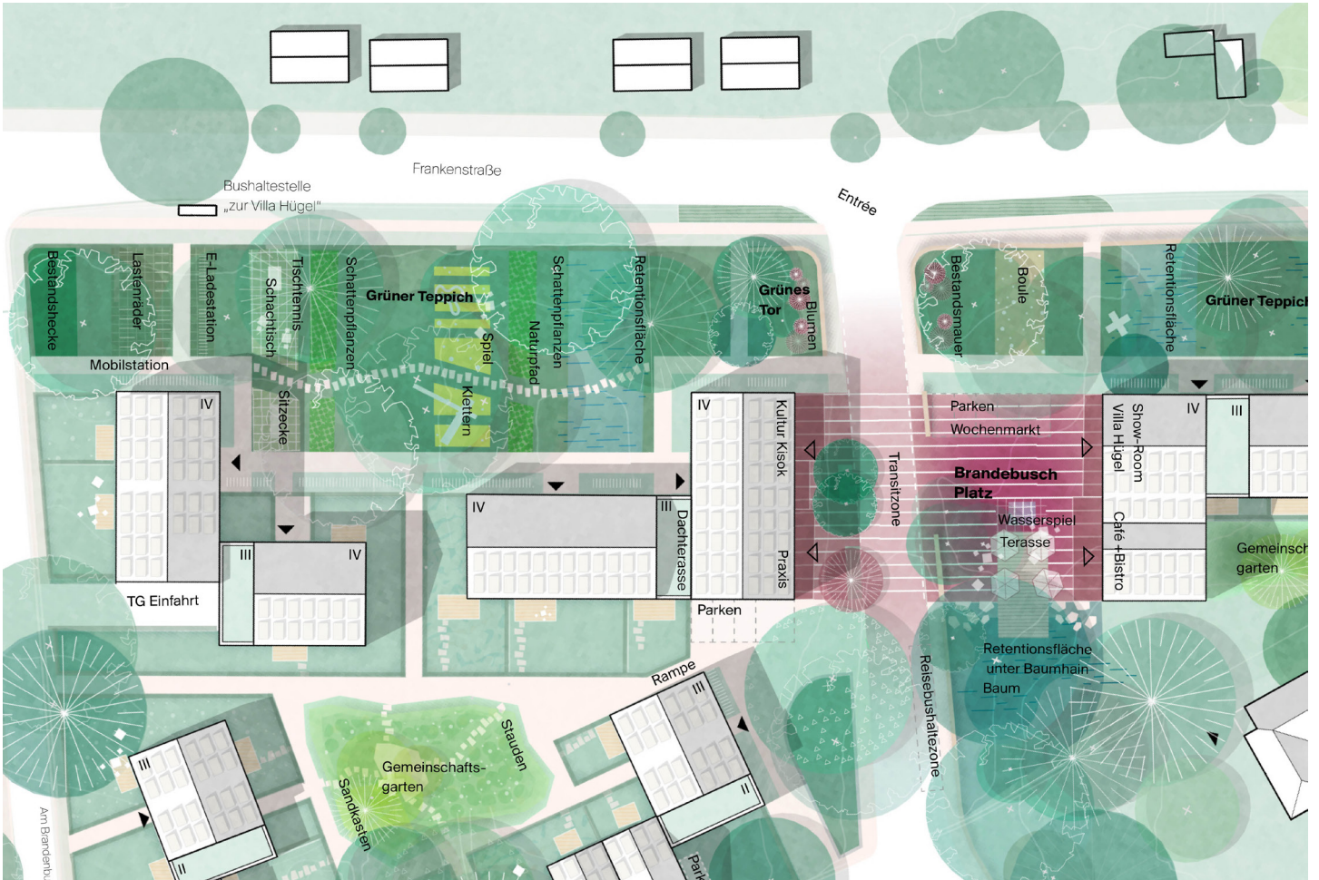
Detailed plan of the green carpet