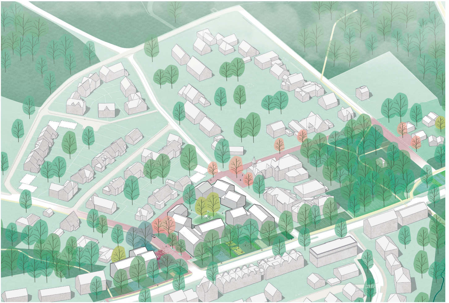
Integration into the listed Brandenbusch neighbourhood