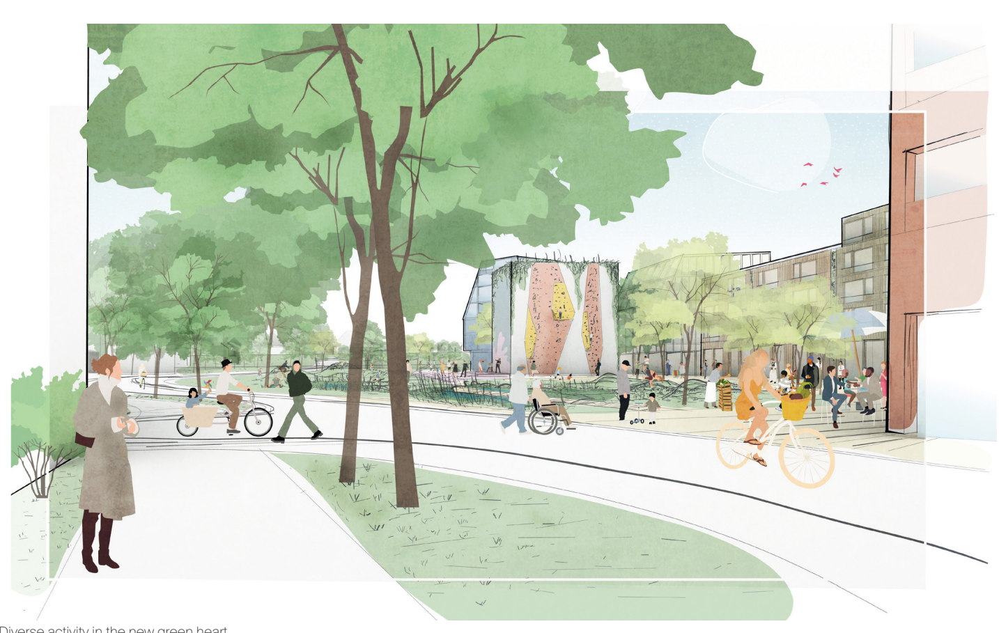
Diverse activity in the new green heart

Concept idea Könecke-Areal + Coca-Cola-Areal