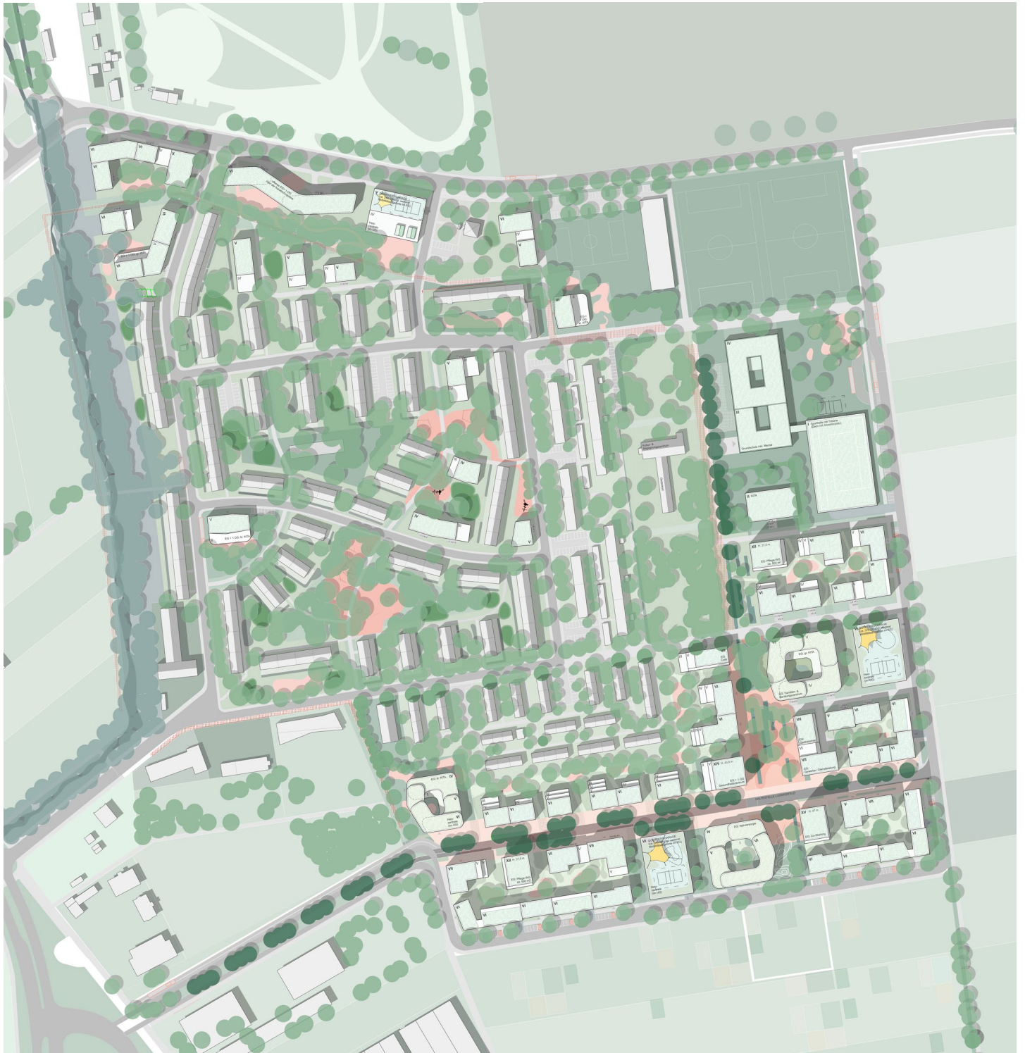
Masterplan - from the settlement to the neighborhood