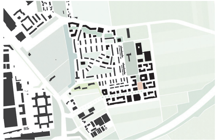
Figure- ground and green plan