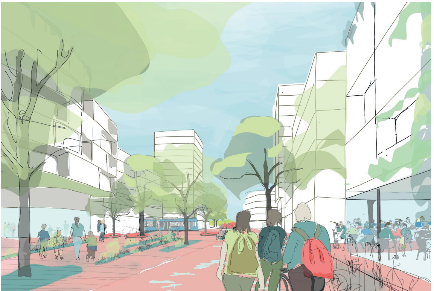
Perspective marketplace: multifunctional focal point in the neighborhood