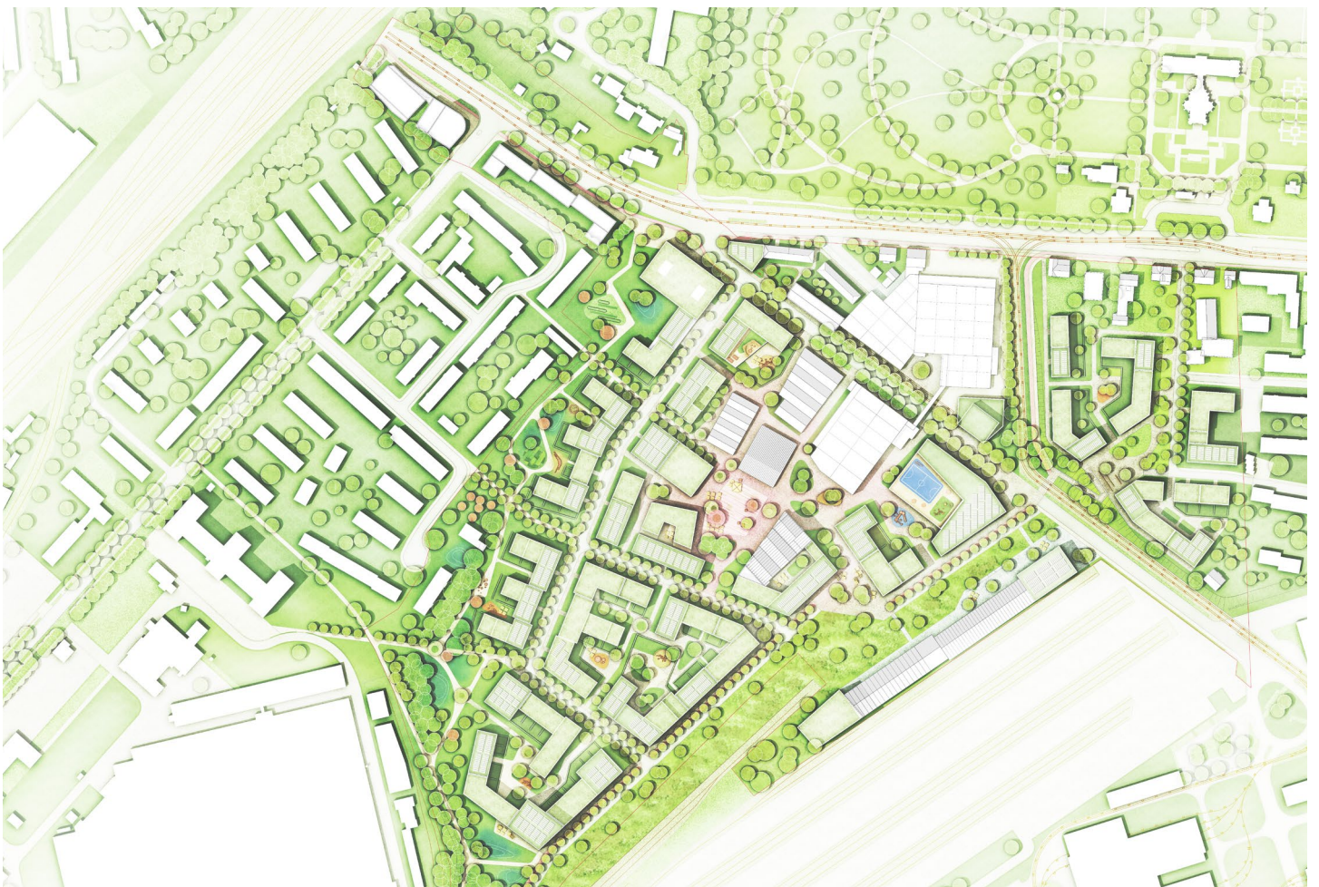
Cultural heart of new district at existing hall structure