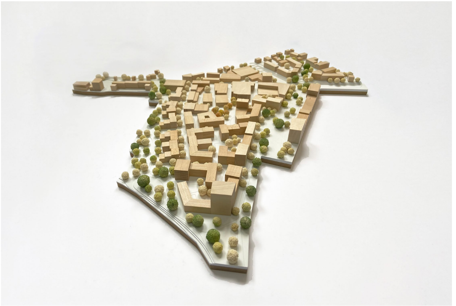
Interconnected spaces and distinctive landscapes