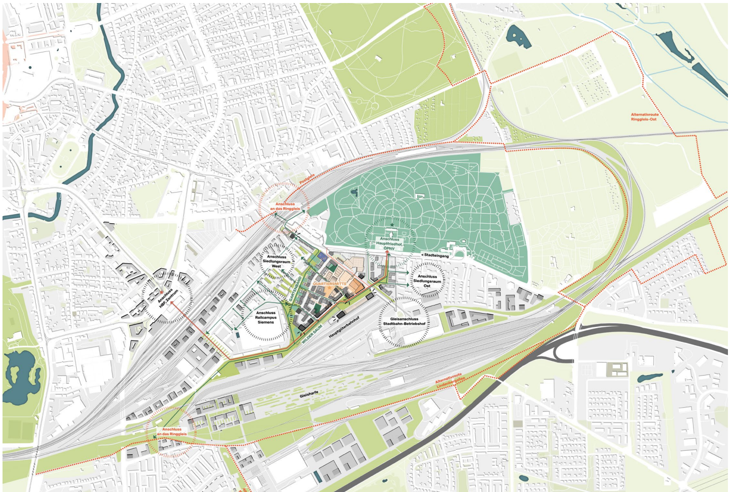
Framework plan, robust building typologies and clearly structures edges