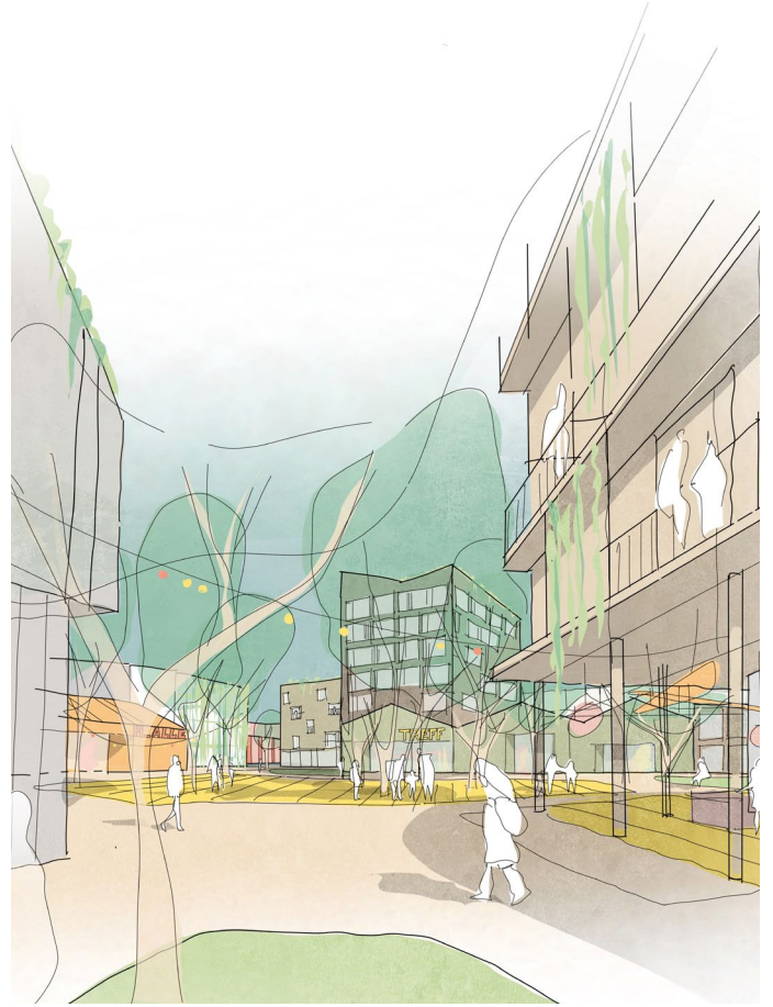
Lively neighbourhood core

The adjacent greenery flows into the neighborhood and picks up on the existing space-creating structures such as groups of trees and fallow land to interweave them with the neighborhood spaces. This creates a lively place with its own identity in a central location. The guiding ideas of BAHNSTADT are consistently developed further. In the midst of the green brackets, a compact and densely mixed urban quarter is created, which is divided into sub-segments by three axes across the green spaces. They create direct path relationships and clear orientation in the urban space.