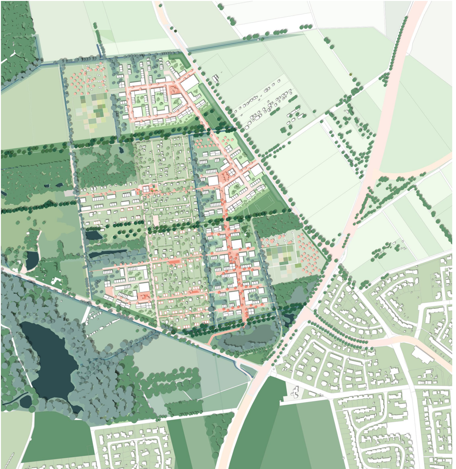
Structural concept - compact development - spacious green spaces