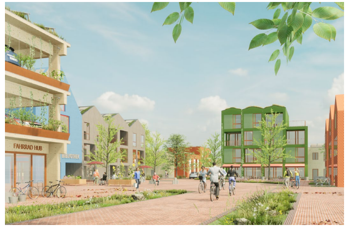
Living on the square, the social meeting point in the quarter, with communal ground floor zones