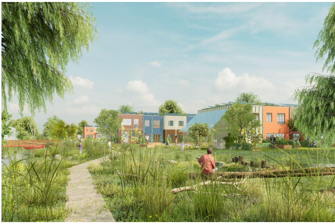
Living by the river, close to nature and relaxing