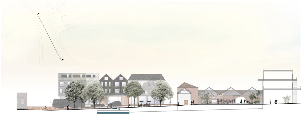
Section north - south