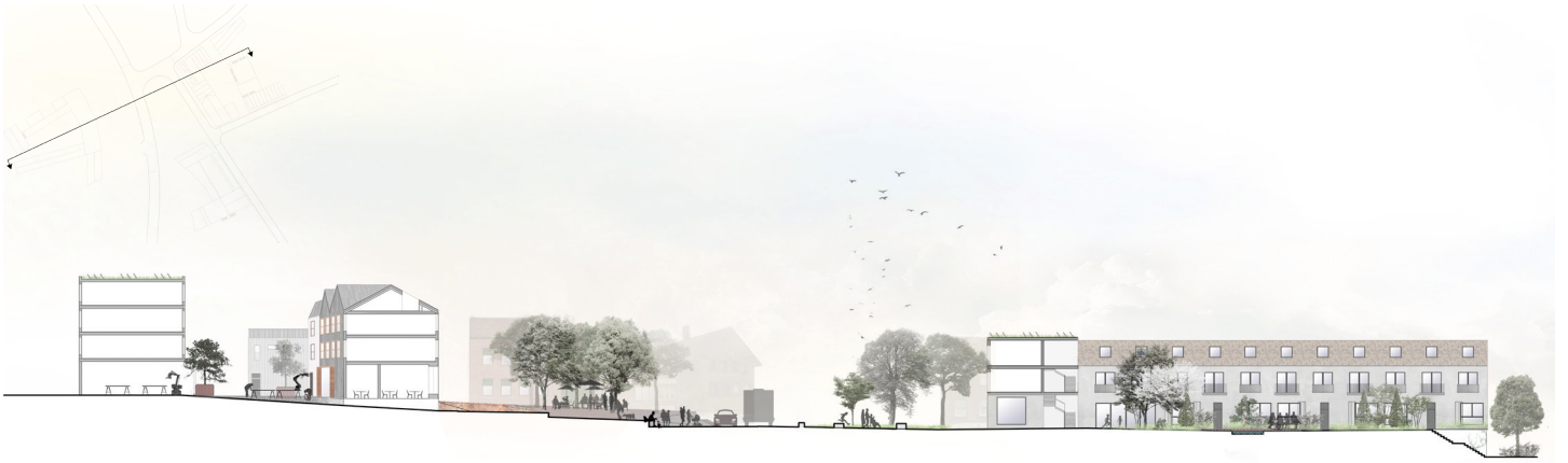
Section west - east