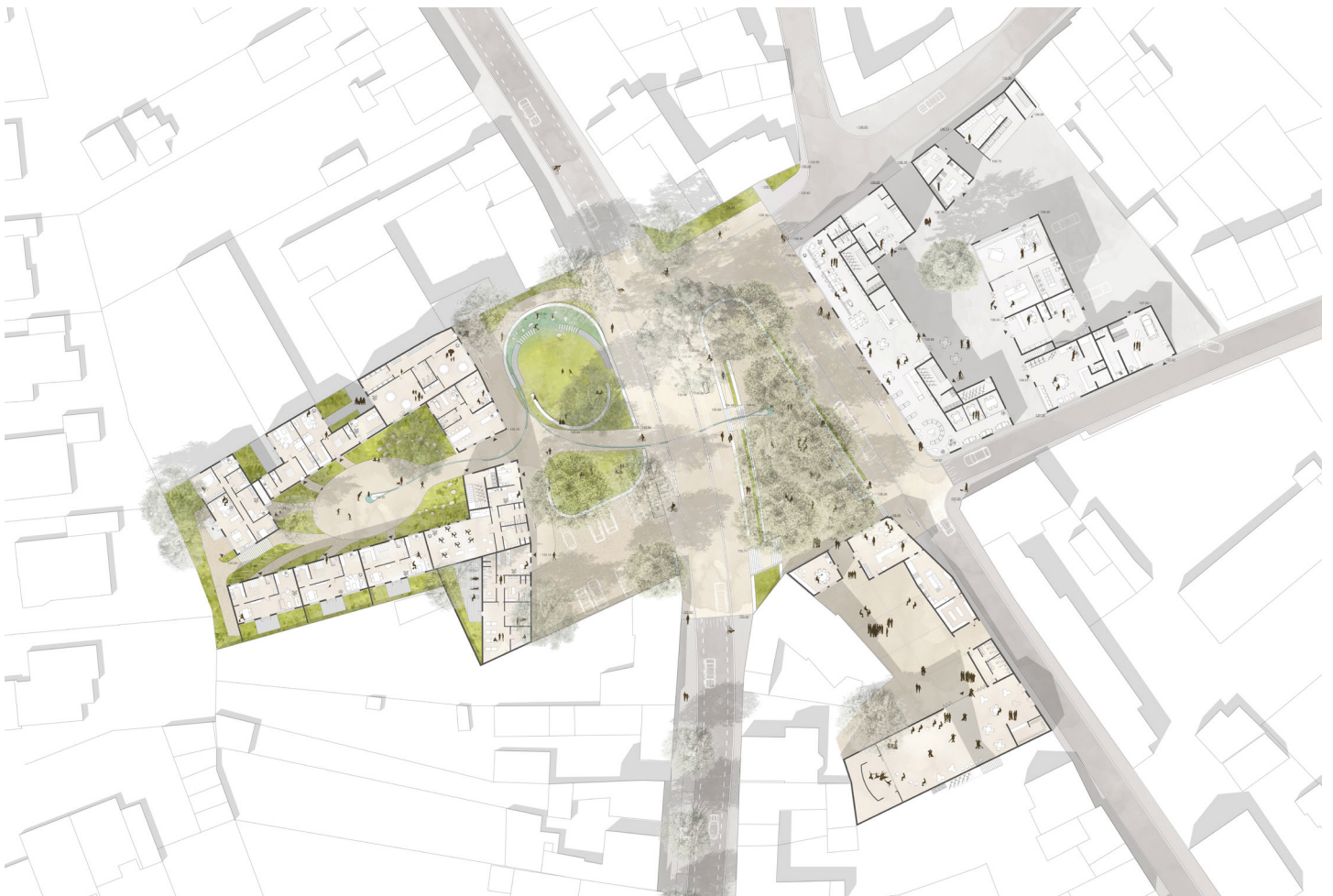
Location map which illustrates the floorplan and the courtyards.