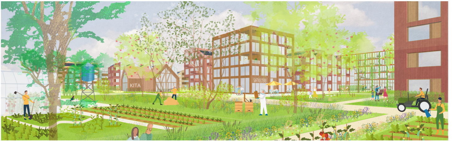
Garden land: Stacked terraced houses and multi-storey buildings with tenant gardens, meeting places, playgrounds and greenhouses