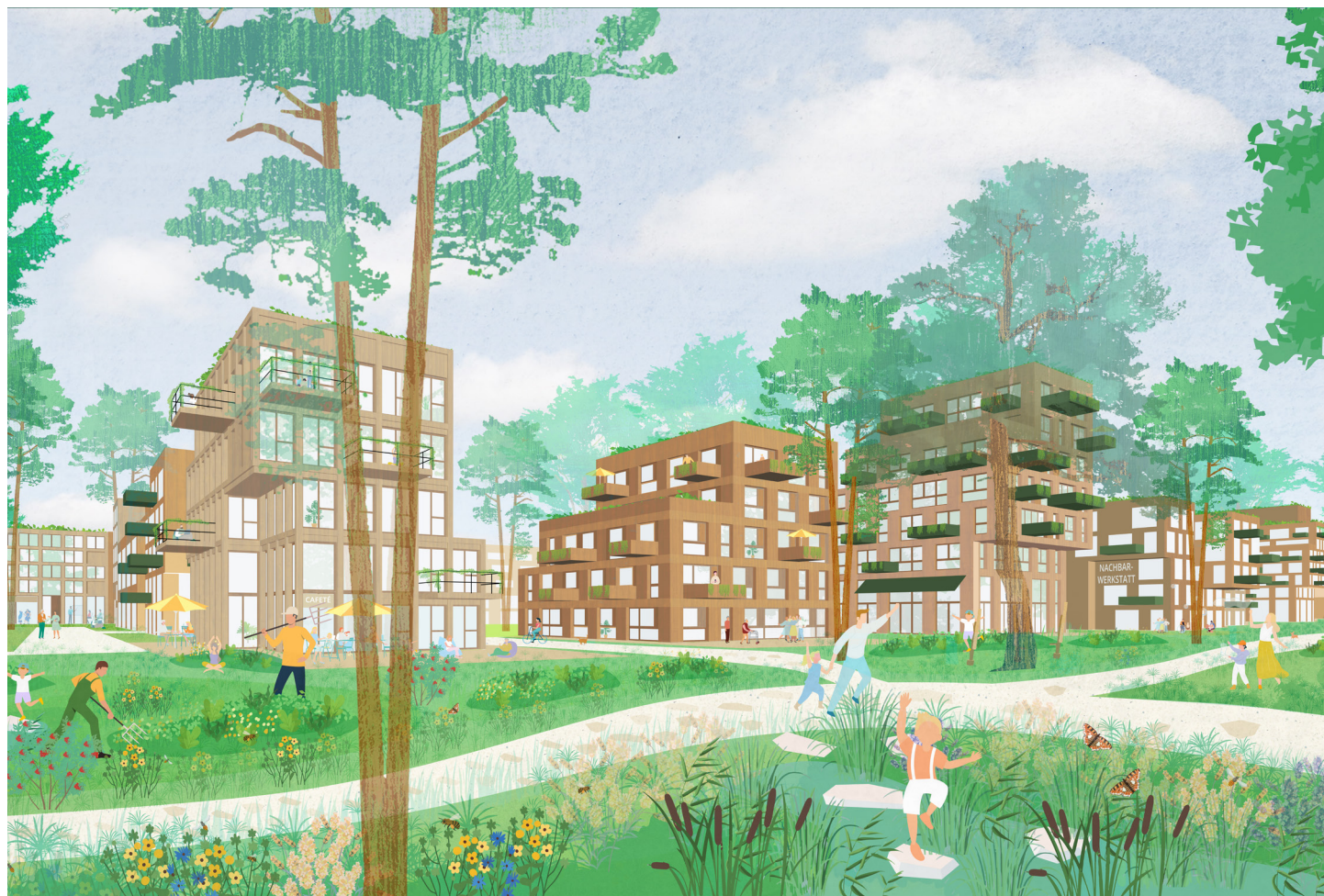
Forest land: open building blocks with terraced rows and stepped point houses on the Schmöckpfuhlgraben and forest