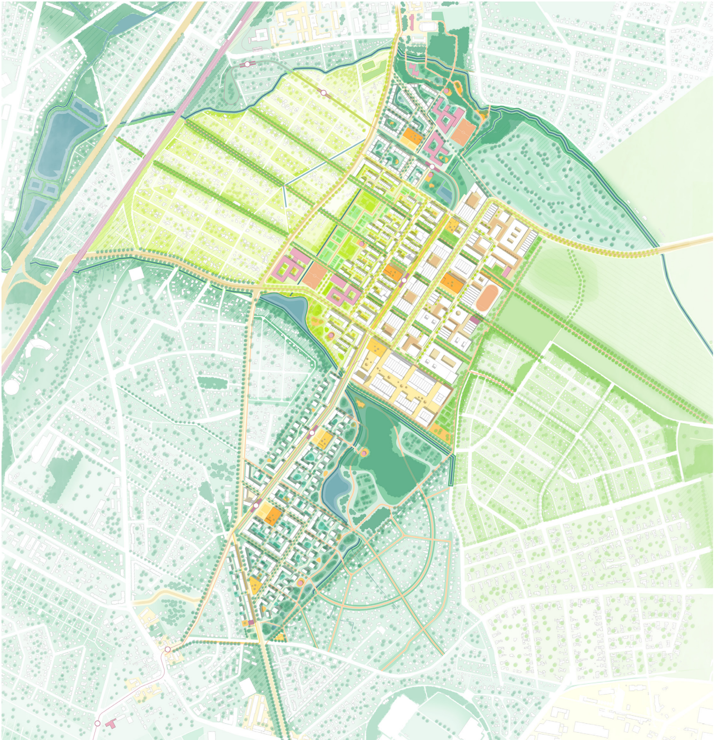
Masterplan - Four Quarters: Forest land, garden land, production land, creek land