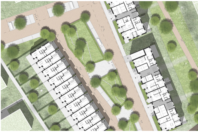
site plan with ground floor plan