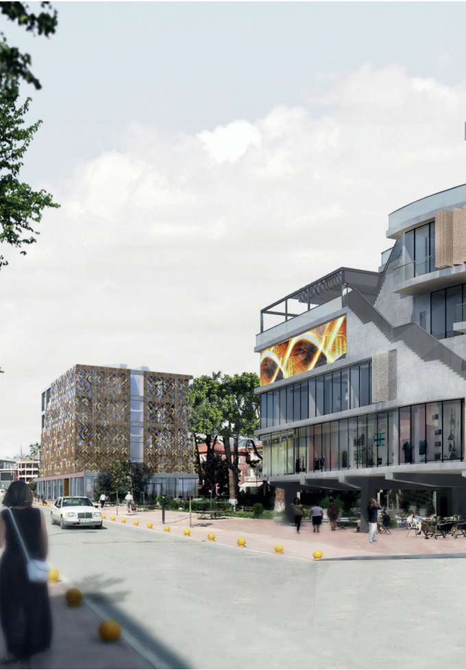
Street view from Rinia Complex towards Bar Center Fier

The addition activates the upper floors and makes them directly accessible from the new main square of Fier, to which the building now prominently orientates. The result is a stepped five-storey volume that is enclosed in a geometrical, rasterized façade. This geometrical façade, in turn, is partially clad in semi-transparent golden shading sheets, which function as a screen against the sunlight, but also bring more unity to the building's appearance. The volume, whose two newly added floors contain a publicly accessible rooftop bar with views over Fier, offers an urban topography that serves the city as a whole.