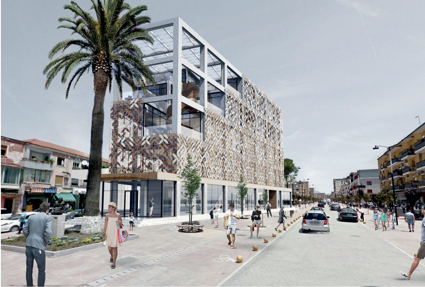
View on golden sheets facade