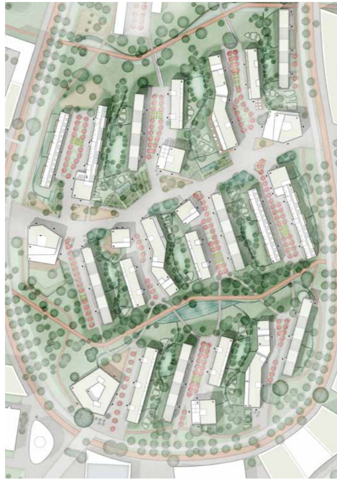
location map M500

Our design offers the potential to rearrange existing deficits in the monofunctional and structural building and open space structures of the current rows of existing houses from the 1950s, to differentiate them in their design and to program them in many ways. The result is a lively quarter for people and nature with open spaces and buildings made of wood that can be used in a variety of ways.