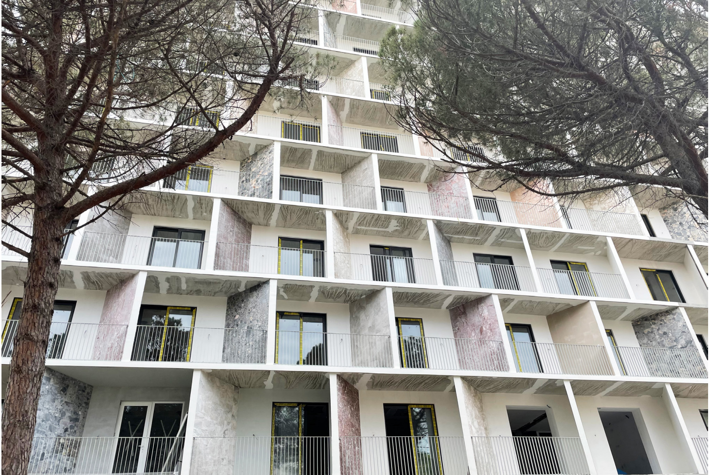
picture taken when DBH was still under construction, 2021.