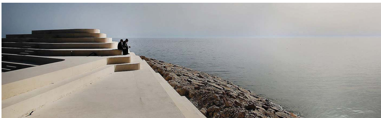
Sunset terrace