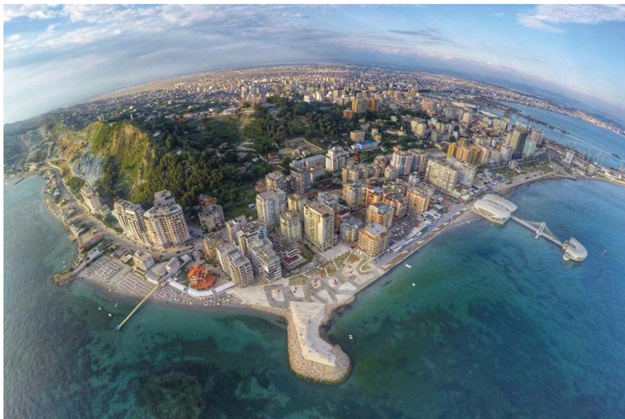
Areal view